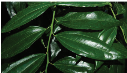
Cinnamomum Verum Leaves

Carminative, astringent, topical stimulant, aphrodisiac, anti-fungal, antibacterial, diuretic, digestive stimulant, antiseptic.